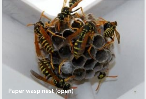
Paper wasp nest (open)