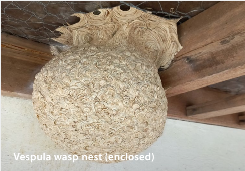
Vespula wasp nest (enclosed)