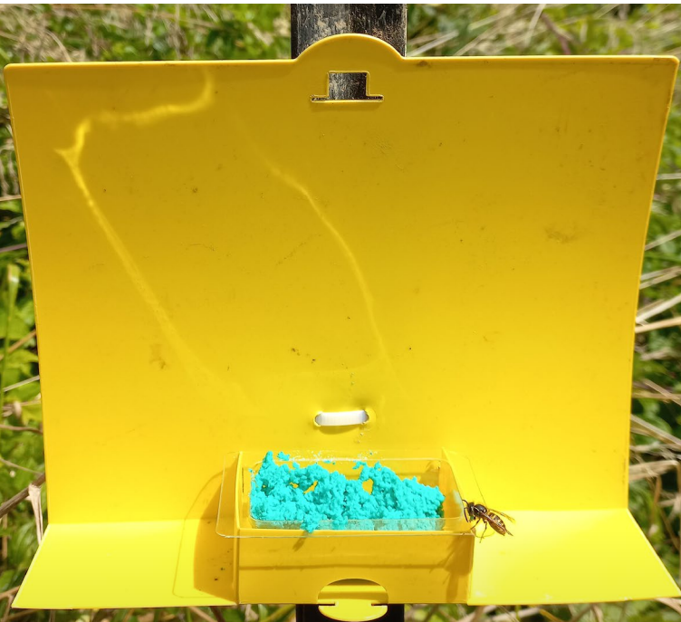
Vespex wasp bait in an (open state) bait station

Control methods – Poison: Surface contact spray, with Bifenthrin (avoid food preparation areas). See back page for insecticide brands and availability.