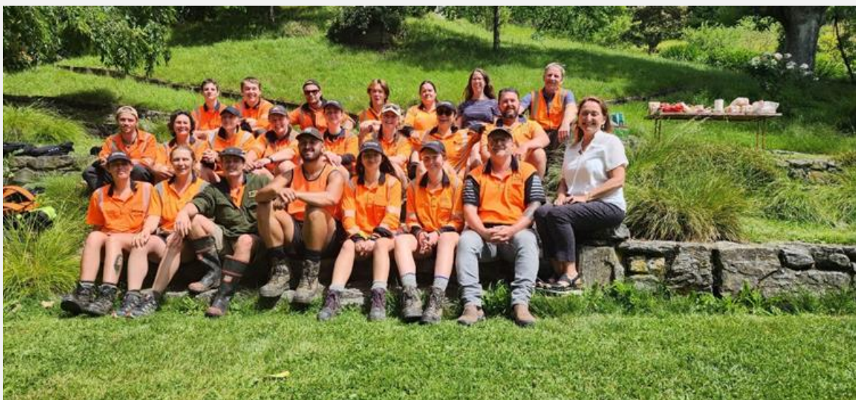
Jobs for Nature Staff – Kūmānu Environmental

Employment opportunities for many of the staff were enhanced through an extensive training programme implemented by Kūmānu Environmental, initially for Project Mahitahi field rangers but now extended to other Jobs for Nature Projects Kūmānu are involved with. As well as external and formal qualifications, rangers train toward achieving a Kūmānu Conservation Ranger Certificate.