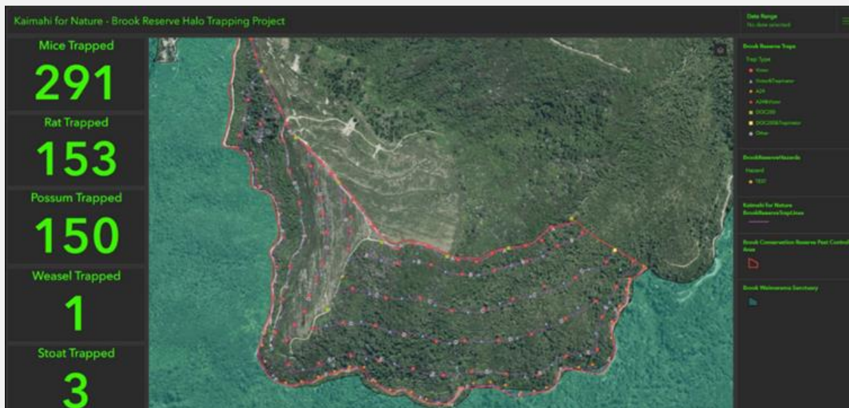
Trap data for Brook Conservation Reserve Project

Project Mahitahi has additional targets set by the Ministry for the Environment over the next two years and these are well on track to being met. Of 125,000 trees to be planted, the team have already achieved 100,000. There was around 10% loss of plants due to the August floods (at most) and these will be replaced over the coming season in addition to approximately 28,000 to be planted over winter.