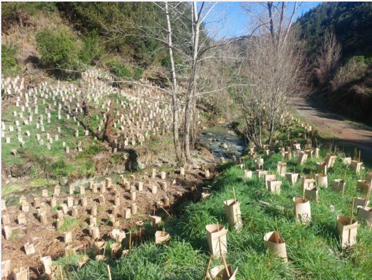
Plantings along Groom Creek itself (above) were undamaged as were those in the wetland area and the Arboretum, including the Friends of the Maitai plantings (below)

As most of the larger plantings had been installed away from the river, for example Venner Reserve and the Ngāti Koata Arboretum, these were untouched. Some plantings directly along the waterway such as Groom Creek have happily not been damaged.